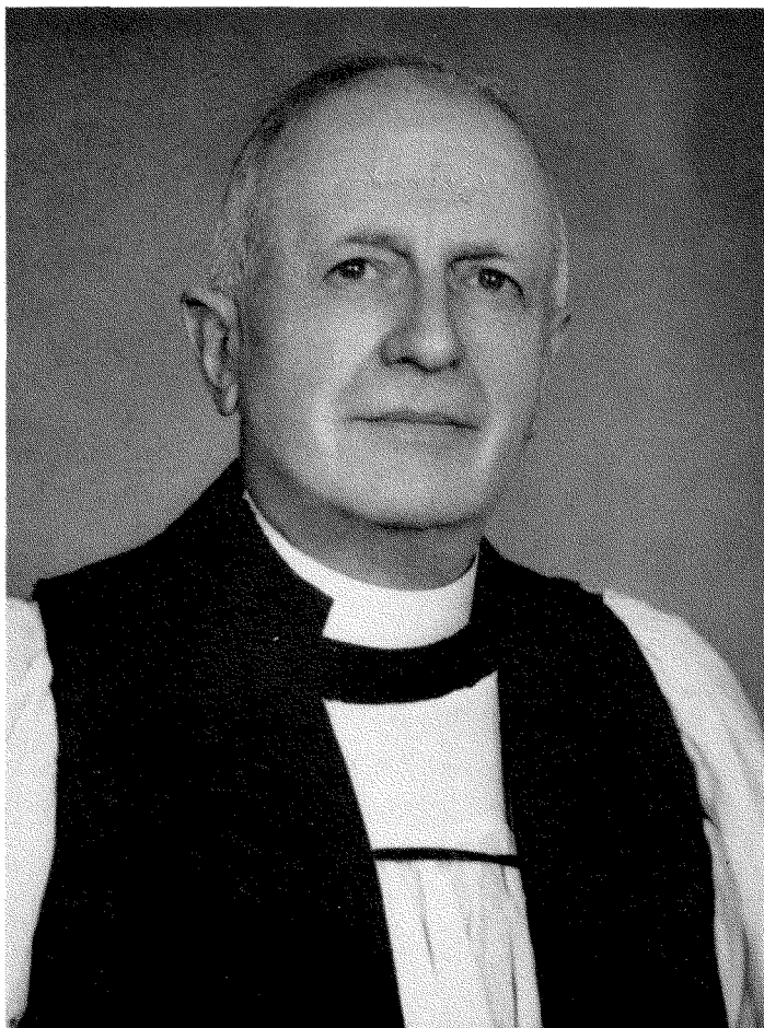
THE RIGHT REV. HENRY KNOX SHERRILL, D.D., S.T.D., LL.D., D.C.L., Th.D., Litt.D.

Presiding Bishop, January 1, 1947 to November 15, 1958.