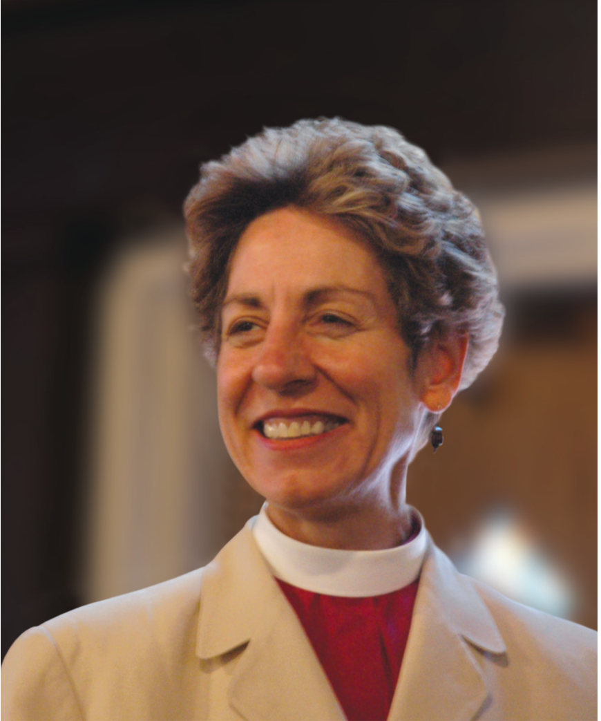
The Rt. Rev. Katharine Jefferts Schori Presiding Bishop-elect