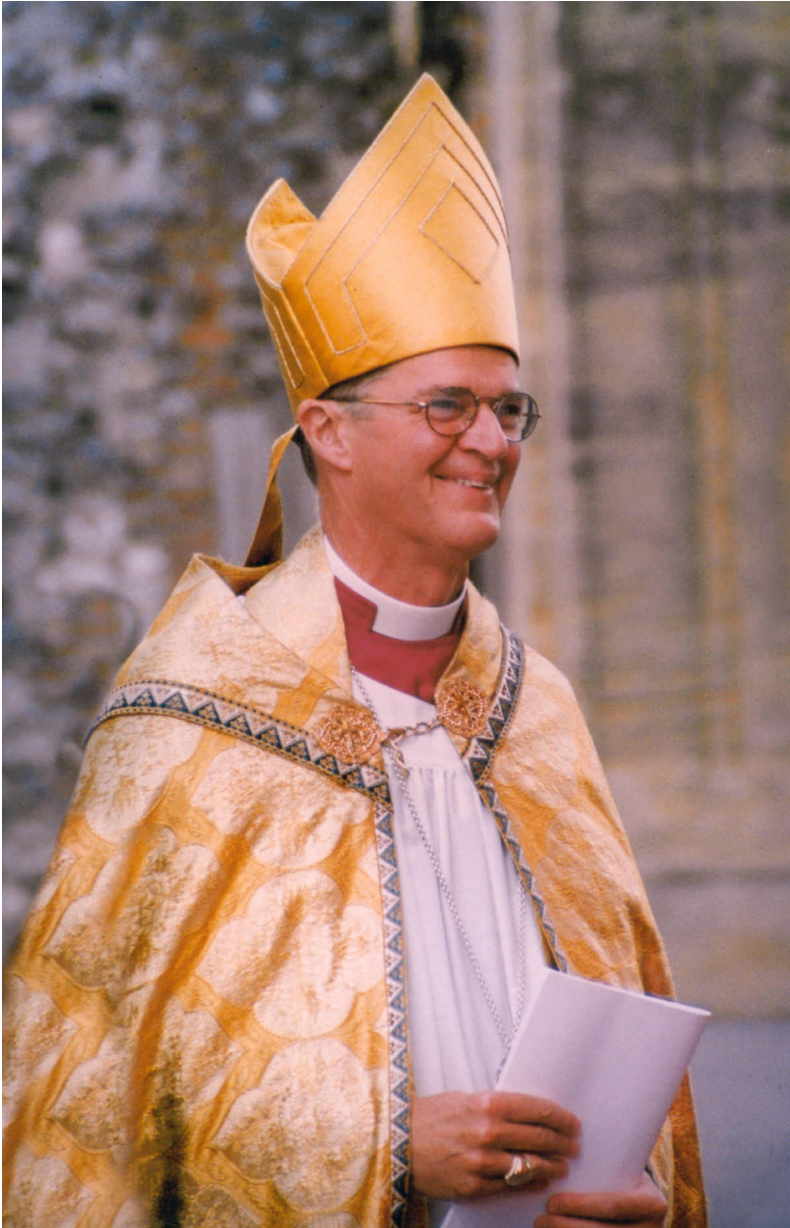
The Most Reverend Frank T. Griswold Primate and Presiding Bishop