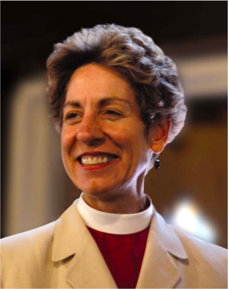
The Most Reverend Katharine Jefferts Schori Presiding Bishop and Primate