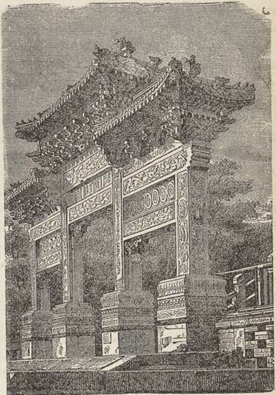
A MONUMENTAL GATEWAY.

that represented in the picture, are sometimes erected to the memory of the so-called virtuous women, especially those of them who have committed suicide ; and everywhere in city and country may be seen these peculiar Chinese monuments. They are made out of fine black stone or of granite, and are often elaborately carved. They are fifteen or twenty feet high and they contain inscriptions in praise of chastity and filial piety. To the Chinese, filial piety is the highest virtue ; but how they have perverted it is seen in the fact that a wife who murders herself is considered in the highest degree filial towards her own and her husband's parents.