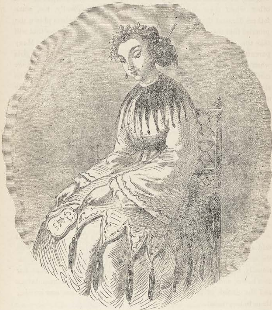
A LADY OF PEKING.

When a girl has reached the age of ten or twelve years her parents