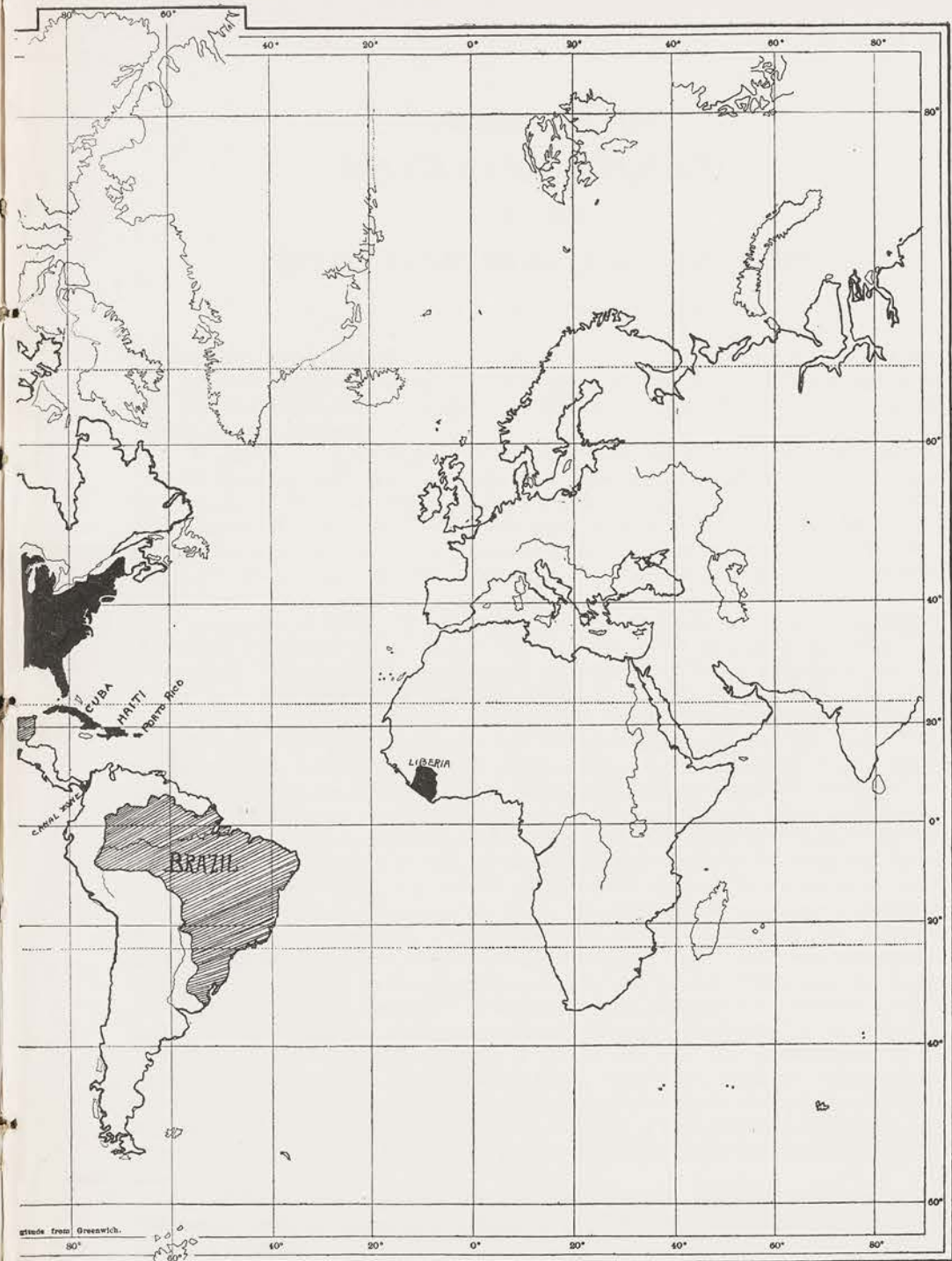
Our Work in It